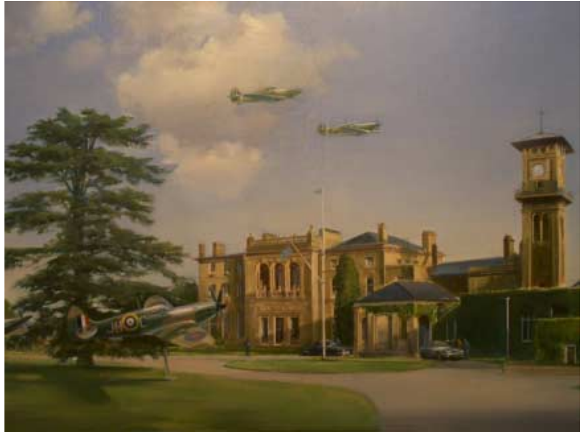
RAF Bentley Priory, Stanmore